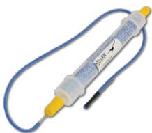
Drying Tube Assembly