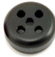
Open-faced Nose Cap